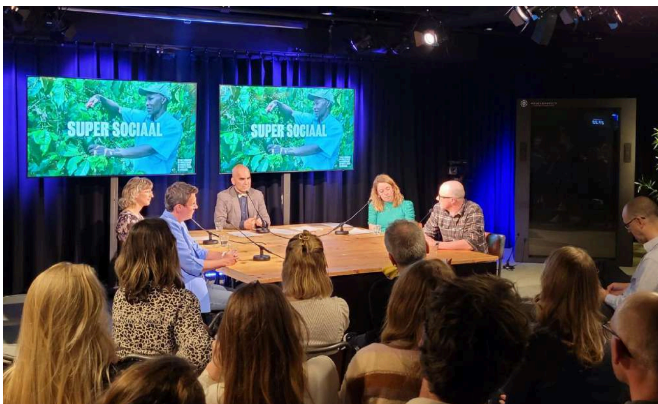
In May 2023, Solidaridad co-organized an event in Amsterdam to discuss the findings from our 'Superlijst Sociaal' supermarket campaign.

Whilst farmers play an essential role in the transition to a carbon-neutral economy and ensuring food security, they should also be paid for their ecosystem services, in addition to the food they produce. Moreover, this is also a win-win for companies interested to invest in this future-proof solution to help tackle climate change.