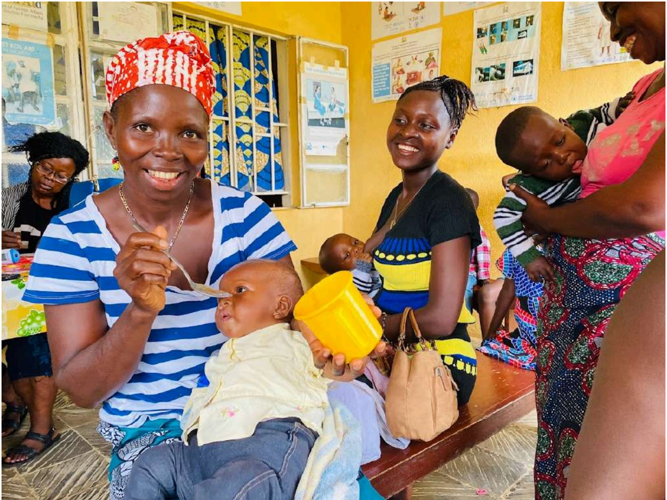
Due to a shortage of nutritious meals, many children in rural Sierra Leone experience stunted growth. Their mothers take action by growing nutritious vegetables.

Our strategy in Europe is guided by the overall vision and mission of the Solidaridad Network. Our vision is a world where all we produce and consume can sustain us, the planet and the next generations. Our mission is to enable farmers and workers to earn a decent income, shape their own future, and produce in balance with nature by working throughout the whole supply chain to make sustainability the norm.