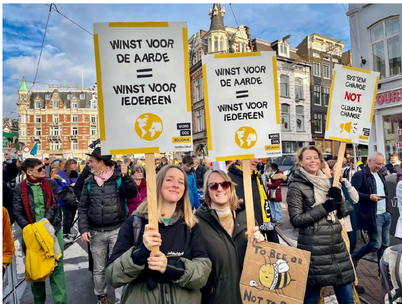
85 thousand people joined the March for Climate and Justice in Amsterdam on 12 November 2023, including some staff of Solidaridad Europe. The march is an initiative of the Dutch Climate Crisis Coalition.

As the world is facing multiple challenges, with a worsening climate crisis; armed conflicts; shrinking civil space and a backlash on human rights and on women's rights, this contributes to growing global inequality and a widening social and political division across various regions.